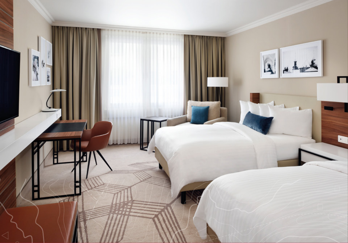
Deluxe Double Double Guest Room