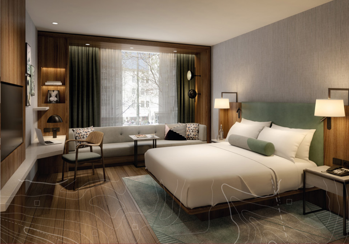
New Deluxe King Guest Room